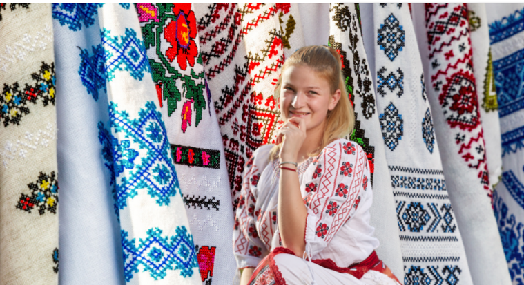
Traditional Romanian Blouse - "Ie": Admire the artistry of Romania's traditional Blouse, a cultural symbol.