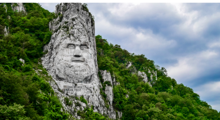
Romania Has Europe's Largest Rock Sculpture: Witness the colossal Decebalus Rex sculpture overlooking the Danube.

As we eagerly anticipate EdYOUfest 2024 in Bucharest, Romania, we extend our heartfelt gratitude to the entire EdYOUfest community. Over the past ten years, we've witnessed the growth of a global family of educators dedicated to innovation, collaboration, and a shared passion for English language teaching.